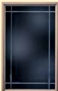
Queen Anne V-Grooved