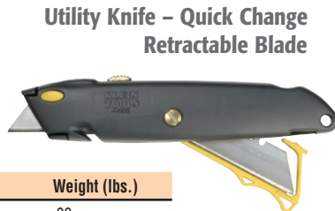
Utility Knife – Quick Change Retractable Blade